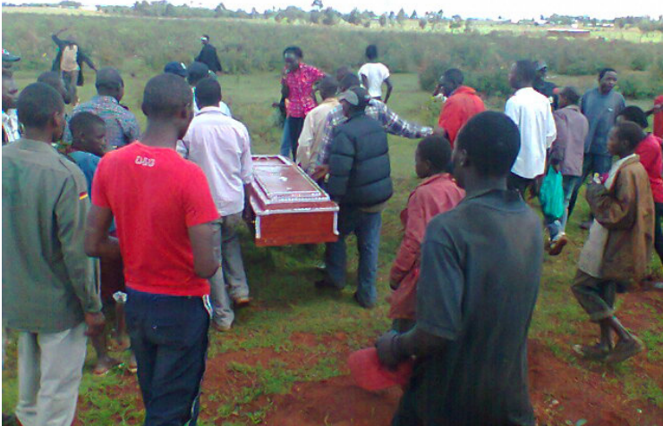
Pioneer grounds - Burial of a street child who was executed by public