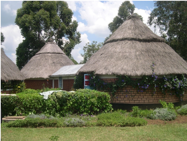
One of the CCI in the OSCAR project in Uasin Gishu County