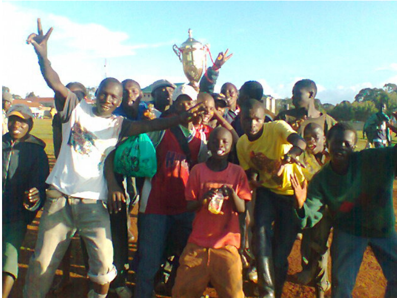
Street children playing an OSCAR organized football match with other children to reduce stigma

HIV/AIDS orphans undergo stigma before and after the death of their parents. The stigma is worsened by the shame, fear and rejection. They may be denied access to schooling, health care and be disinherited. (85,86)