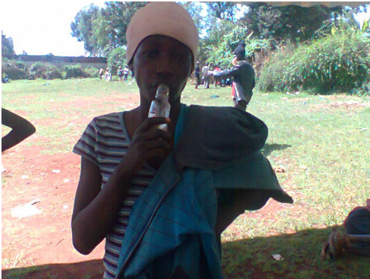
Street girl sniffing glue

that the barriers to stopping use of drugs were addiction; peer influence and social network; coping and survival on the streets; availability and affordability; poverty; and negative family influence. The facilitators of quitting drug use were desire to quit; positive peer influence; self care; positive family influence and programs and policies. From this it was clear that family and peer influence were key to stopping drug use. If one had a supportive family or peer group he/she was likely to quit but if one had a family that brewed and used alcohol and a peer group that were addicted to the drugs, then it would be difficult to stop. (72)