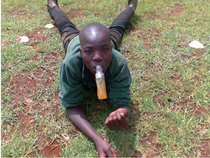
Orphan sniffing glue due to lack of parental protection and guidance