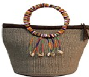
Plate 3.1. The Kyondo (Traditional Basket)

A cooperative of 900 Kamba women in Kitui, Kenya, dye and weave tough fibers extracted from the spikey leaves of the agave sisalana plant, commonly known as sisal. (See plate 3.1, and plate 3.2, examples of a sisal handmade traditional basket, the Kyondo .)