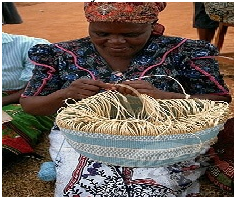
Plate 3.1: Woman Weaving