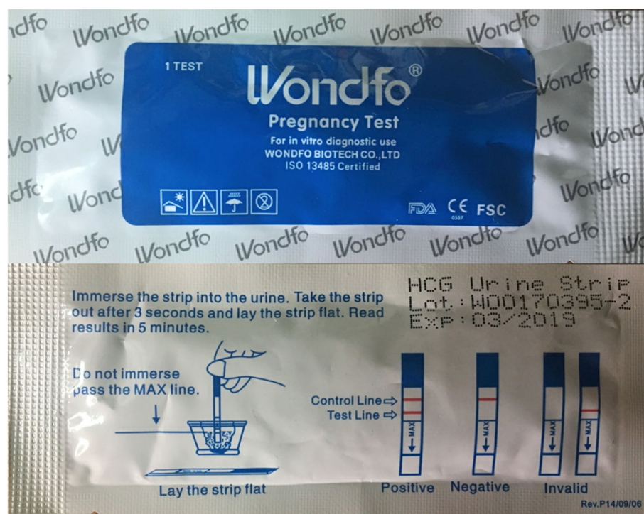
Fig. 2 Image of the urine pregnancy test kit, front and back

on participant demographics and outcomes are reported separately.